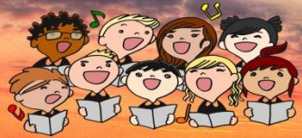
Pobal Scoil Choir