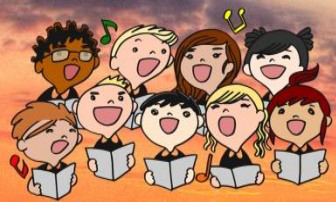
Pobal Scoil Choir