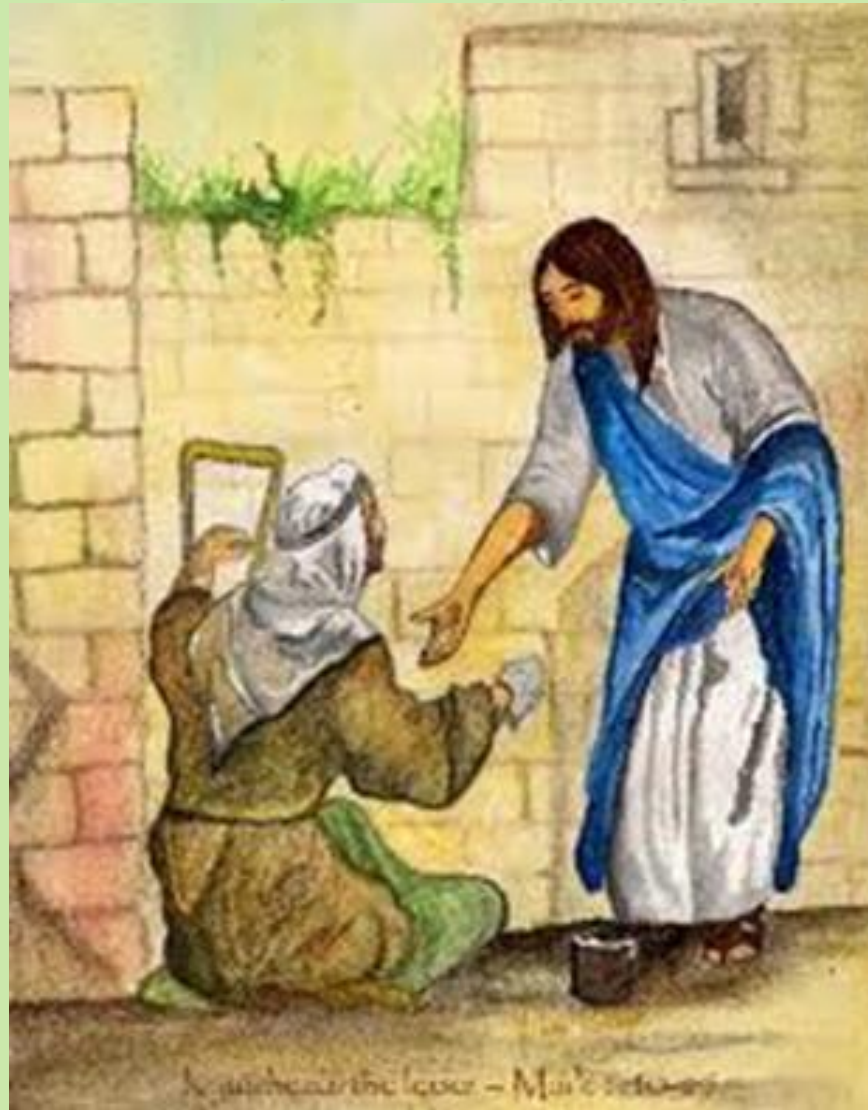
Jesus Cleanses a Leper