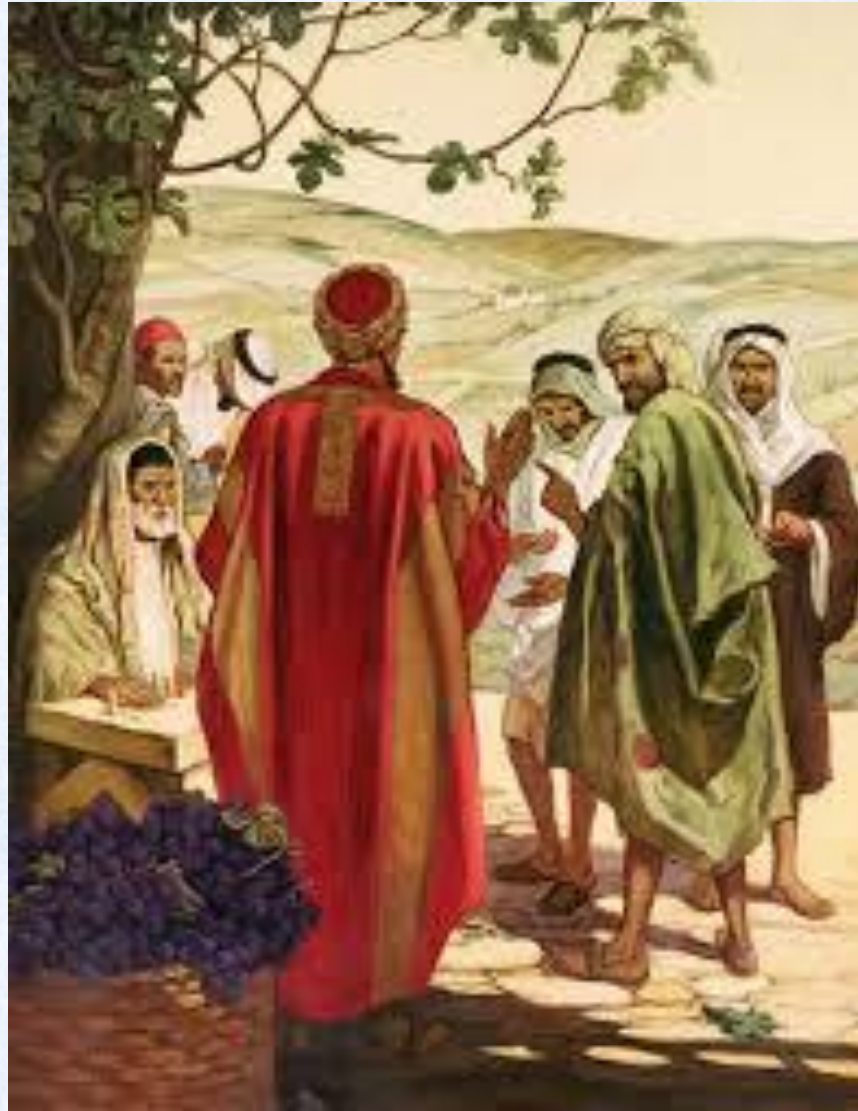
The Labourers in the Vineyard