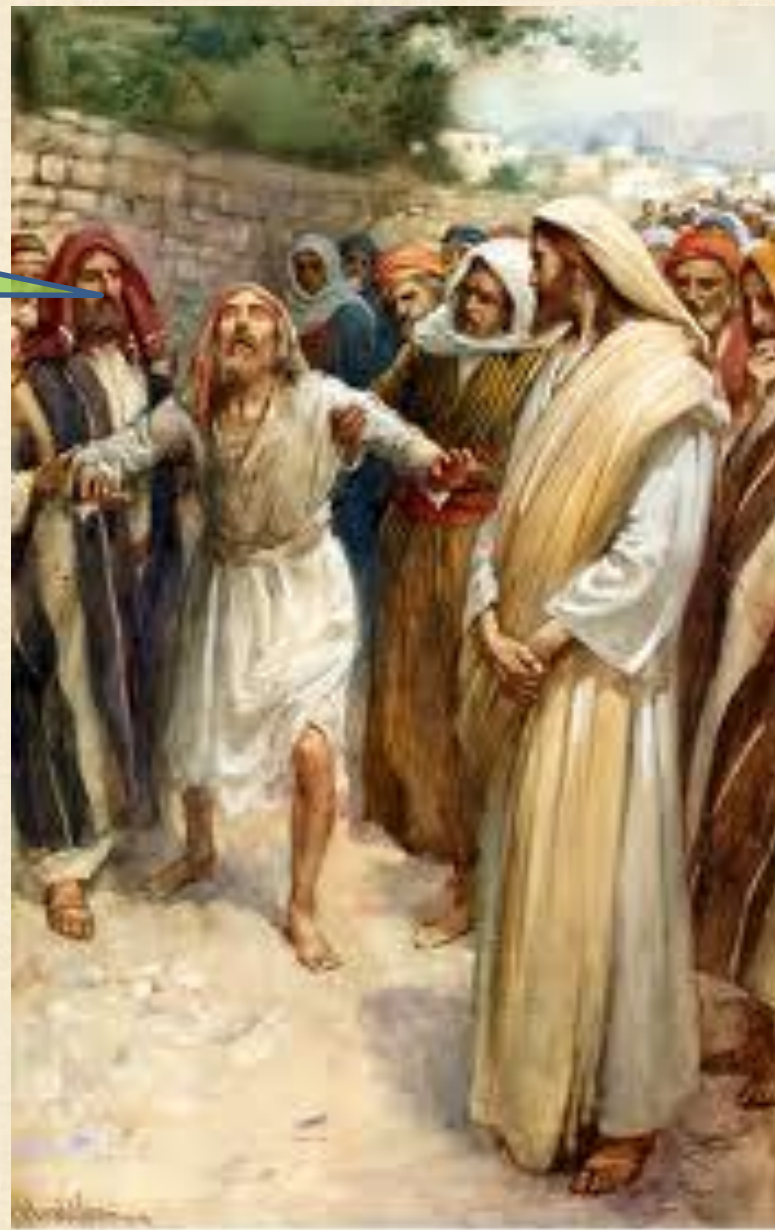
The Healing of the Blind Bartimaeus by Harold Copping