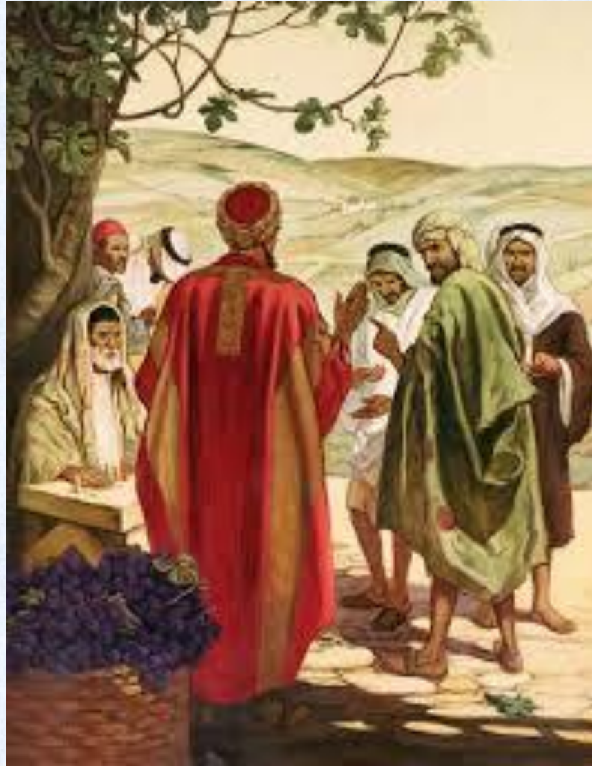
The Labourers in the Vineyard