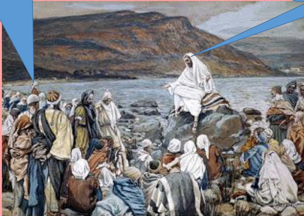
Jesus Teaching by the Seashore by James Tissot

I watched Satan fall from heaven like a flash of lightning.