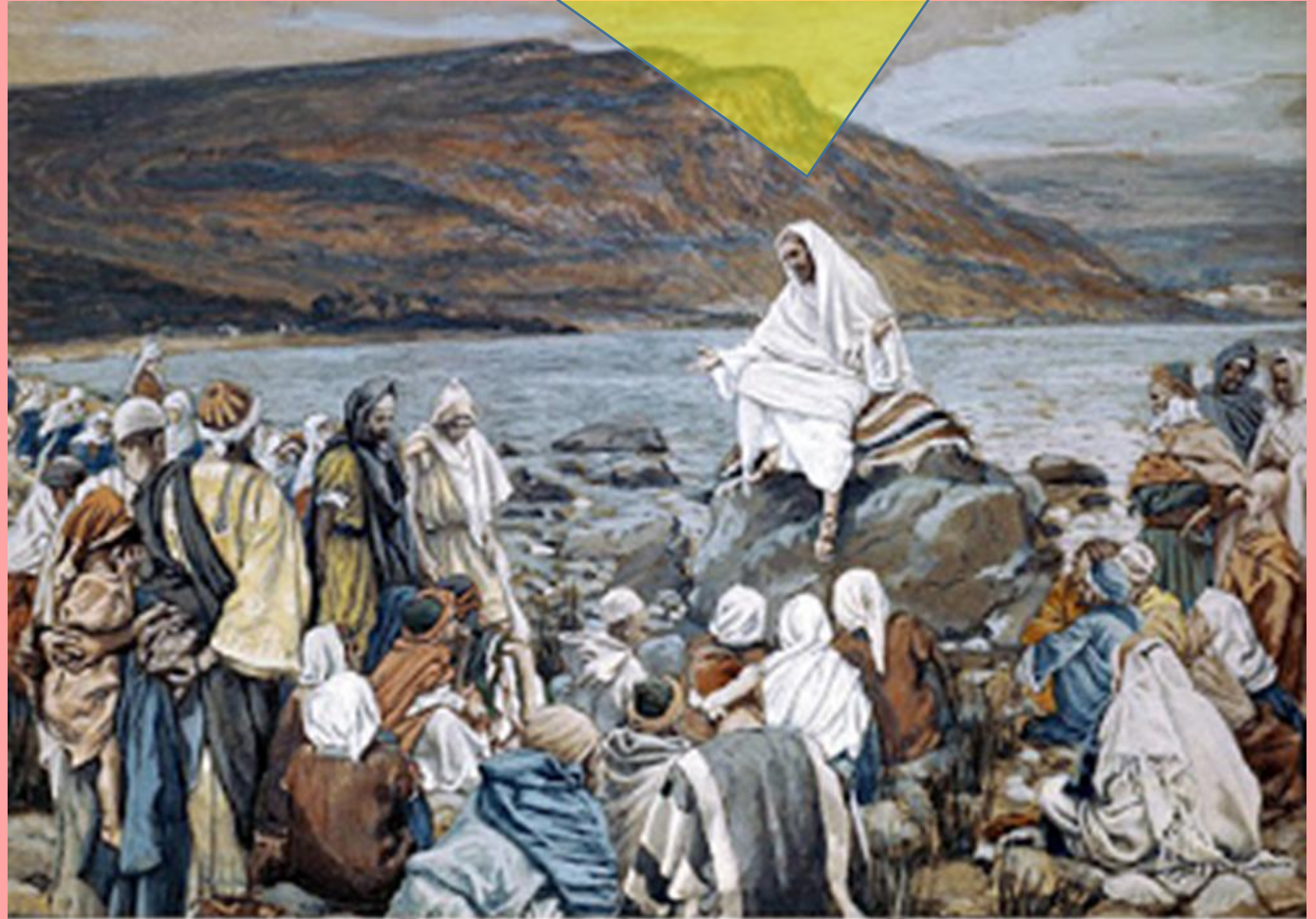
Jesus Teaching by the Seashore by James Tissot

God trusts us so much that He has given us power to be Christ for others.