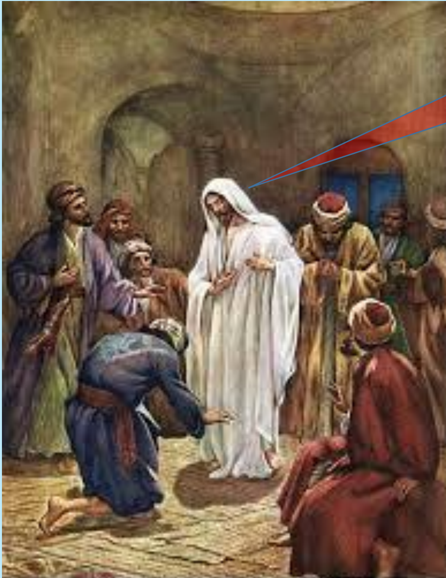
Jesus appears to the disciples by William Hole

While staying with them, he ordered them not to leave Jerusalem, but to wait there for the promise of the Father.