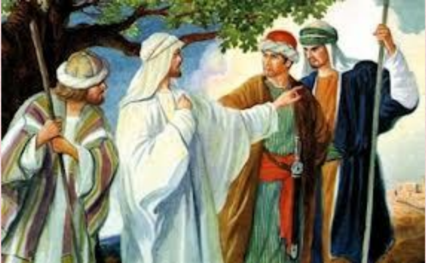
The Commissioning of the Disciples